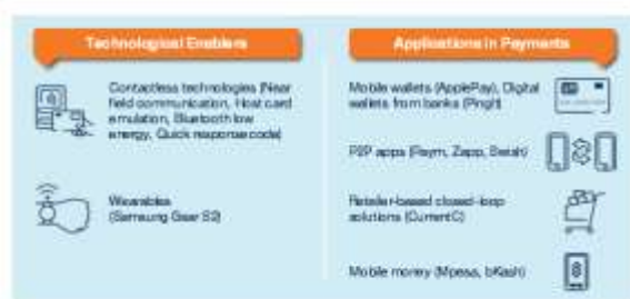
Exhibit 1: Levers of Front-End Innovation

Organizations find that the frauds in the e - Payment transaction is increasing year after year. Association for Financial Professionals AFP (2012) has reported percentage of organizations subject to attempted and/or actual payments fraud has shown an increase day to day. As per